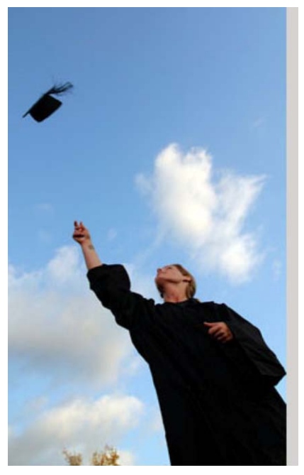
Student grants help prepare the next generation

Benefits of the IGA student grants go well beyond monetary support for research. As part of the grant conditions, students present