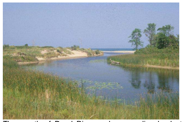
The mouth of Dead River and surrounding land at Illinois Beach State Park mimics the pre-settlement setting of the Chicago River mouth.

transportation and commerce. Wave action and associated transport, deposition and erosion of lakeshore sand determined where the mouth of the Chicago River would be located along the Lake Michigan shore. This in turn set the stage for what is now the Chicago Loop and the central business district. Without question, Chicago – the largest metropolis in the central North American continent – is a product of its geology.