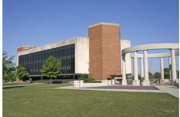
U of I Springfield Conference Center

The Illinois Groundwater Association is holding its Fall 2009 Association meeting on Tuesday, November 3rd at the University of Illinois Springfield (UIS) Conference Center, room PAC C/D. The Conference Center is located in the UIS Public Affairs Building at 1 University Plaza, Springfield, Illinois. Parking is available to meeting