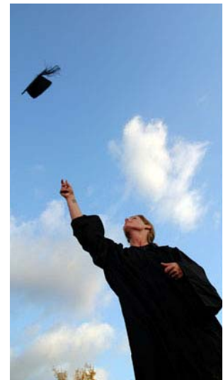
Student grants help prepare the next generation

Benefits of the IGA student grants go well beyond monetary support for research. As part of the grant conditions, students present their findings at an IGA meeting - a great opportunity to improve professional presentation skills in front of a supportive and interested audience. Overall, involvement in the IGA gives students a chance to network with groundwater professionals in academia, government and