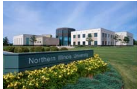
NIU Rockford Campus

Northern Illinois University (NIU) hosted the Spring 2009 IGA and 2009 North-Central regional Geologic Society of America (NC GSA) meeting at the NIU Rockford campus. The IGA meeting was on April 1 st and the NC GSA meeting was on April 2-3, 2009.